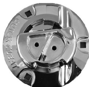
Model 420 Chrome