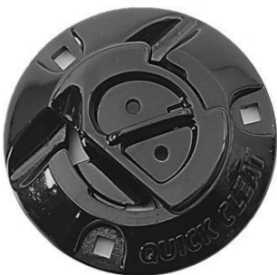
Model 425 Black

Rotary cam action allows adjustment of slack lines without removing the rope.